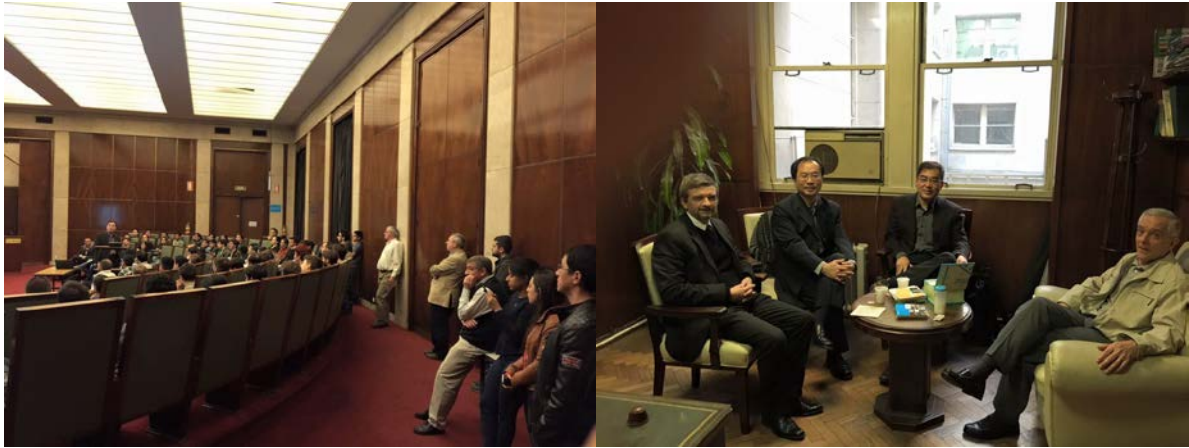
Left: University of Buenos Aires – lecture attendees